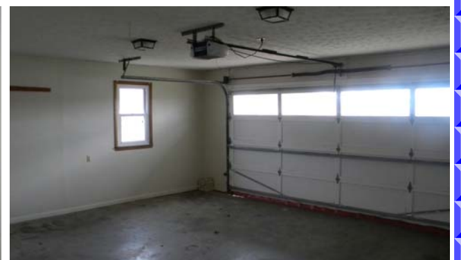
Two Car Garage

**TERMS** 20% DOWN ON REAL ESTATE DAY OF AUCTION. BUYERS MUST PAY BALANCE ON OR BEFORE 30 DAYS. POSSESSION ON OR BEFORE 30 DAYS. 2012 TAXES PAID BY THE BUYERS.