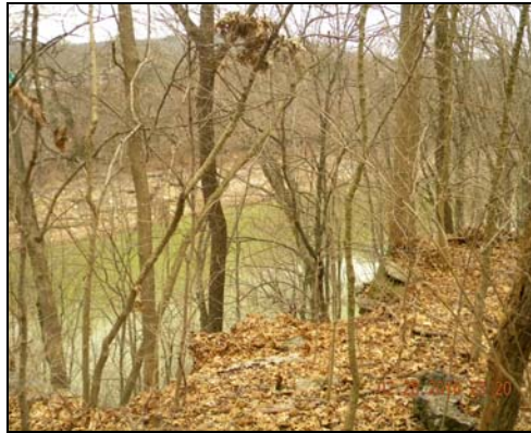
YEAR ROUND LAKE VIEW