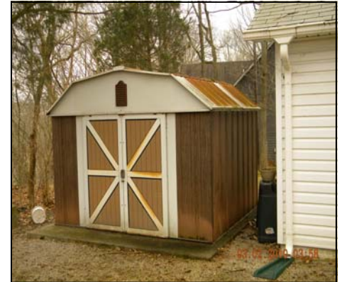
EXTRA STORAGE BEHIND GARAGE

This fantastic lakefront property would make an excellent summer home, rental or personal home. The house has 2 bedrooms, bath, kitchen, dining room and living room. The house has electric heat and window air conditioning. There is a one car detached garage and a small storage building ( all pictured above). The lot is approximately 145'x150' and offers a year round lake view. This large lot is just 400' off South 27 and just minutes from Burnside Marina. The large driveway affords parking for boats or an RV.