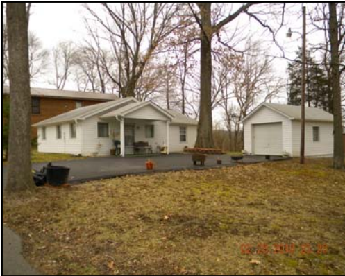
HOUSE ON WOODED LOT

WE HAVE BEEN COMMISSIONED BY THE HEIRS OF THIS ESTATE TO SELL ON THE ABOVE TIME AND DATE THE FOLLOWING: